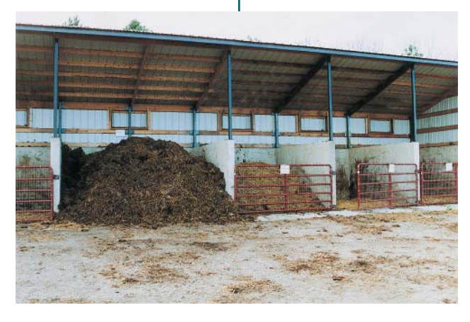
Multiple bin composting structure; note gates on fronts of bins.

Bins should be located close to each other to facilitate moving compost from bin to bin. Consider snow and wind loads in the design. If you find you have problems with dogs or other animals that dig in the piles, you might want to add a removable gate. Opposite are some photos of typical composting structures used in Minnesota.